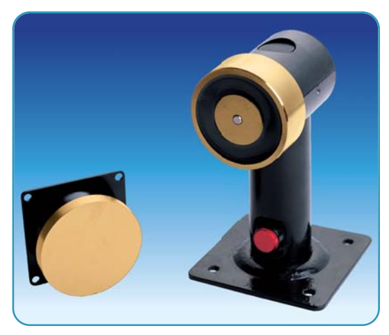
FLOOR MOUNT R60PCV12 R60PCV24