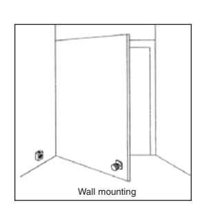
TYPE OF INSTALLATION