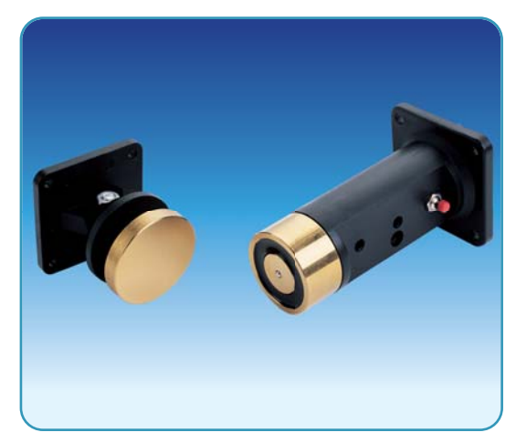
WALL MOUNT R40PCH12 R40PCH24